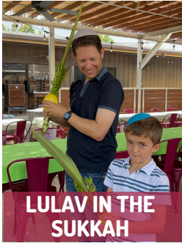
LULAV IN THE SUKKAH

When a student is 100 plus miles from home, YOU give them a home in Aggieland.