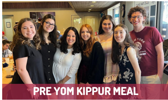
PRE YOM KIPPUR MEAL

A young Jewish Aggie was so overwhelmed right after the High Holidays ended and said, "Rabbi, I can't tell you how much my Jewish Pride is just at an all-time high. I have never been prouder to be Jewish, I even wore a Kippah on campus for the first time."