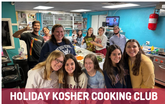
HOLIDAY KOSHER COOKING CLUB