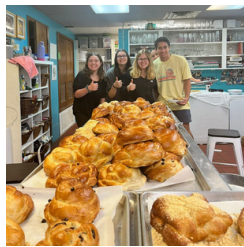
ROSH HASHANAH CHALLAHS