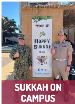
SUKKAH ON CAMPUS

I wanted to thank you and Rabbi for making Rosh Hashanah so fun and so enjoyable. It made my first holiday away from home so much easier just knowing that I have you guys and the family and Chabad."