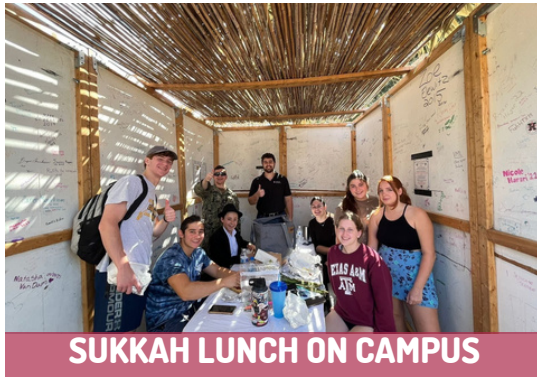
SUKKAH LUNCH ON CAMPUS

A young Jewish Aggie was so overwhelmed right after the High Holidays ended and said, "Rabbi, I can't tell you how much my Jewish Pride is just at an all-time high. I have never been prouder to be Jewish, I even wore a Kippah on campus for the first time."